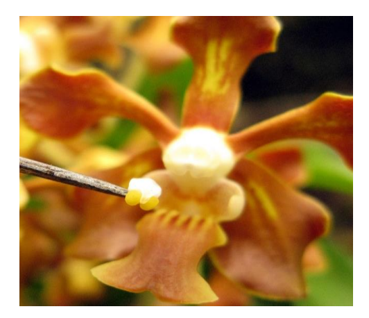
Fig. 3: Orchid cap-pollen mass-corona The pollen block adhered to the tweezers on one end of the core beak

divided into two categories: the curtilage type and the orchid type. Wild type flowers (such as hard leaf pocket orchid P. micranthum t. Tang et f. t. Wang, apricot yellow pocket P. armeniacum s. c. Chen, et f. y. Liu) are similar to most wild flowers, where the sepals are usually small, where their lip for margins are curled inward spherical or near spherical capsule. This type of flower is mainly pollinated by bees (Liu et al., 2005; Shi and Cheng, 2007). Pocket orchid flowers, such as the purple hair pocket orchid P. villosum (Lindl.) Stein, and ribbon pocket P. parishii (Rchb. F.) Stein, long flap pocket P. dianthum t. Tang et f. t. Wang, have sepals that are usually larger, lip to edge upright helmet capsule. The pocket orchid flowers are usually pollinated by aphid flies (Atwood, 1985; Bänziger, 1994; 1996; 2002; Shi and Cheng, 2007). Apricot yellow pocket in the wild type flowers use false stamens with puce markings and maroon spot lip to emulate the food source plant of the pollinators. Foodborne cheating pollination is the ability to rely on the insect's sense of smell at a distance (Cribb, 1998). There are also differences in the patterns of flowers that attract pollinators. Those that rely on simulated sources of food to deceive pollinators (such as Aristolochia purpurea) have yellow stamens and attract pollinators by simulating honey beads, pollen or other foods (Bänziger,