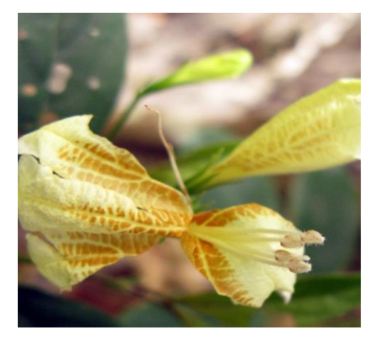
Fig. 2: Yellow flower rock flower structure

The order by quantity is as follows: Cop3, Cop2, Cop1, Sp, Sol, Un